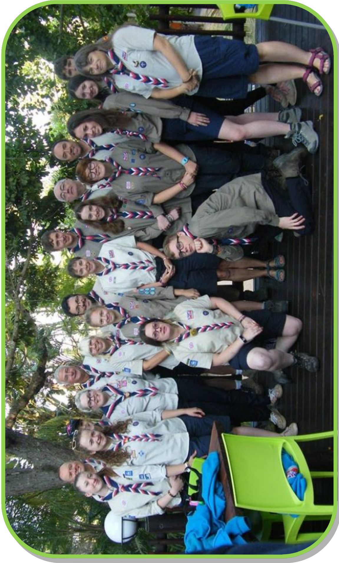
The District representatives that have just safely returned from their expedition to Swaziland.