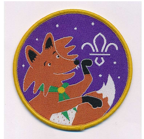
Scouts Christmas Appeal Fox Fun Badge 2019