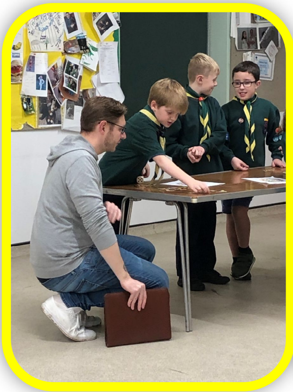
From Templars Cub Leaders

The £150 will be spent on equipment to help the Cubs make healthier choices, especially at indoor camps, and the Cubs chose a soup maker, sandwich toasters, blender and a popcorn maker and are looking forward to using them at our Christmas Camp!